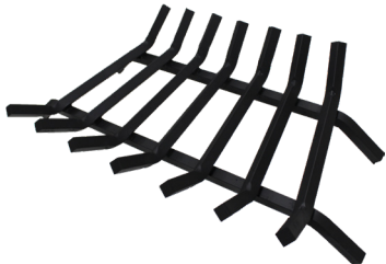
M Series - 27"