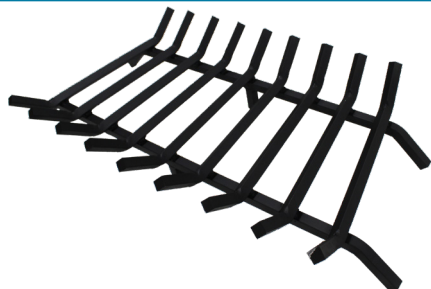
D Series - 35"