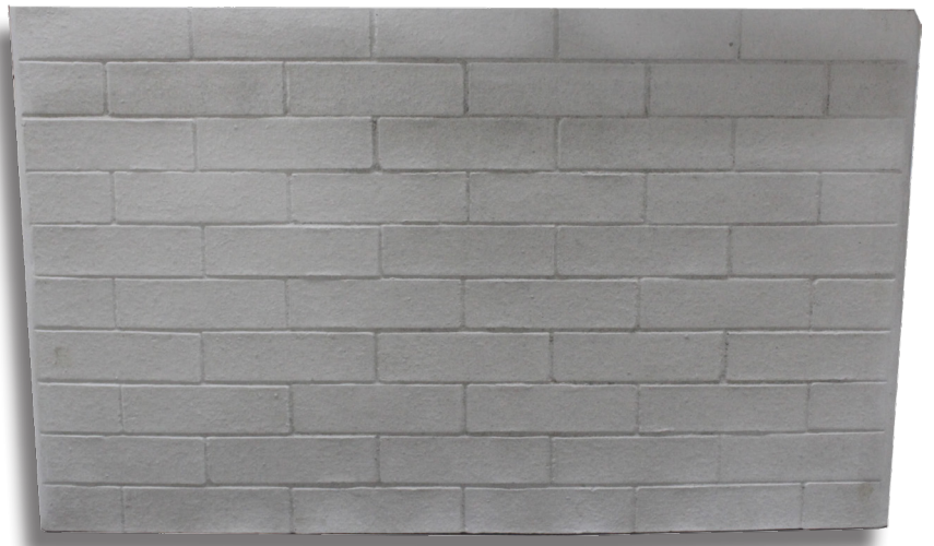
24" x 40" Panel

Hargrove's Refractory Panels are available in 24" x 28" and 24" x 40" and are designed to be cut to fit any fireplace.