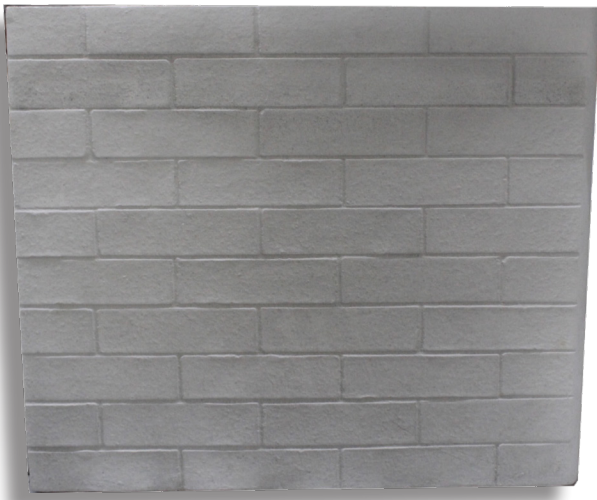
24" x 28" Panel

Hargrove's Refractory Panels are engineered for extreme heat and made with glass fiber reinforced concrete. Our panels can be used as floor, back, or side panels. Panels can be installed in prefabricated, factory built, zero clearance and masonry fireplaces. It is suggested that a masonry or diamond blade is used to make the cuts.