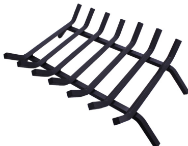
ST Series - 27"