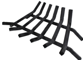
Z Series - 23"

Hargrove Wood Burning Grates are made of heavy duty barstock and are available in Zero Clearance (Z Series), Medium Depth (M Series), Deep (D Series), and See-Thru (ST Series) styles.