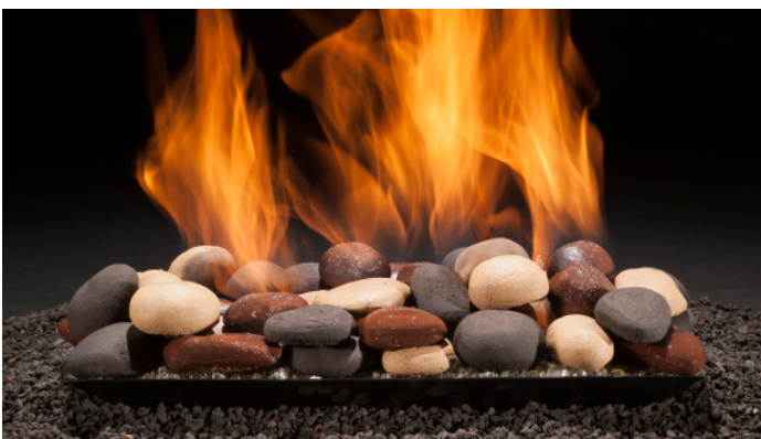
Blazing River Stones 24" Set

Blazing River Stones on the Full Pan Burner System offer a rustic, low profile stack allowing for a distinctive flame pattern.