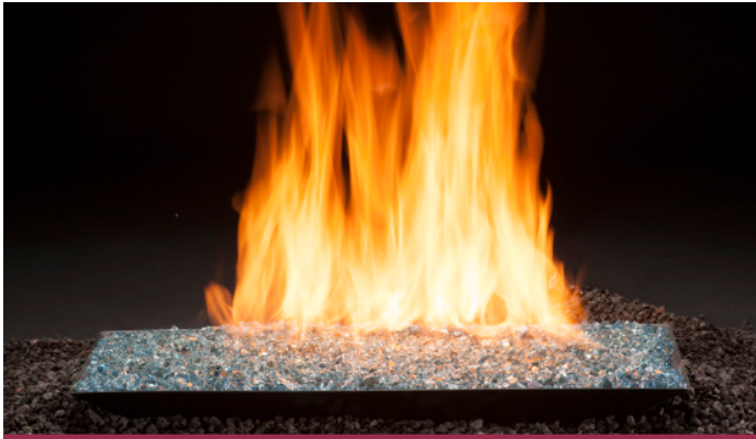
Fire Glass 24" Set

Fire Glass on the Full Pan Burner System provides a reflective sparkle as the flame dances across the glass.