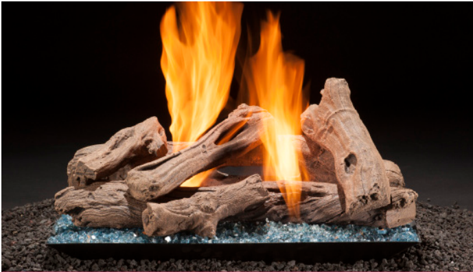
Driftwood Logs 24" Set

Full Pan Systems provide a stylish way to add flare to your fireplace. The low profile tray formed burner gives the elegant effect that the fire is rising out of the fireplace floor. Multiple media options are available including Fire Glass and River Stones.