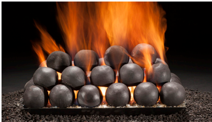
Colonial Cannon Balls 24" Set

Colonial Cannon Balls on the Full Pan Burner System create a unique symmetrical stack where the flame comes up through the middle of the set.